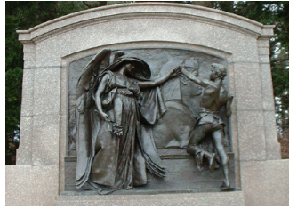
The Milmore Memorial, bronze, 1889-93, Forest Hills Cemetery, Jamaica Plain, MA

4 Williamsville Road PO Box 827 Stockbridge, MA 01262