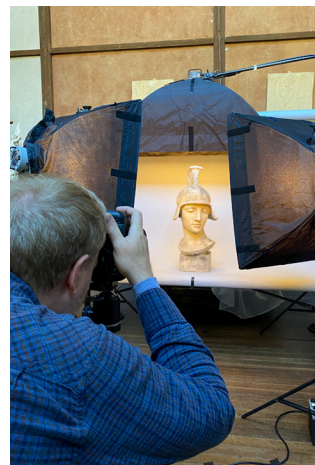
In process: "Photo studio" in the Studio with Victory , November 2022