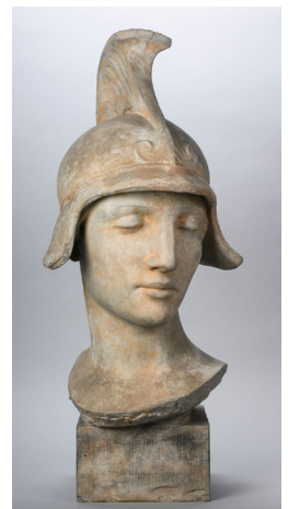
Final photo of Victory , full-size plaster head, 1923