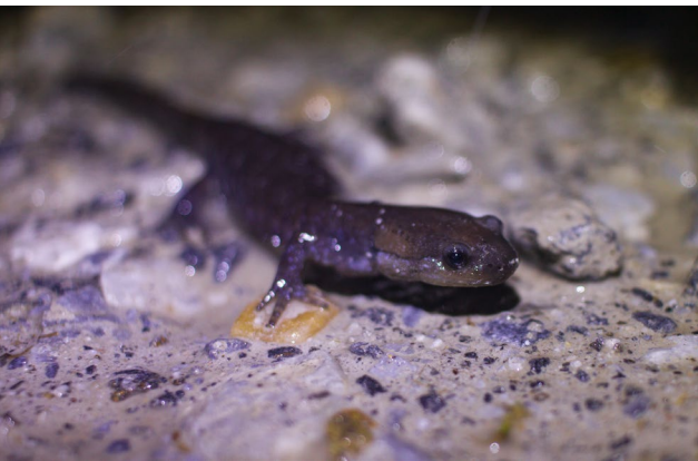
A Blue-Spotted Salamander migrating to Chesterwood's vernal pond

Preservation is our mission, and that goes well beyond French's home, studio, and collections. With a Climate Action Sustainability Grant from the National Trust for Historic Preservation, Chesterwood took a closer look at the wildlife creatures who make their home throughout our 122-acre campus. The grant underwrote the creation of a preservation management plan to protect our seasonal wetlands and wildlife. A large vernal pond along Williamsville Road serves as an important mating and hatching habitat for animals such as the Blue-Spotted salamander (protected under the Massachusetts Endangered Species Act), as well as other varieties of salamanders and frogs. Look for announcements about nature walks around Chesterwood with our partners at MassAudubon and check out a new educational signboard in the parking lot to learn more about our vernal ponds and amphibian friends!