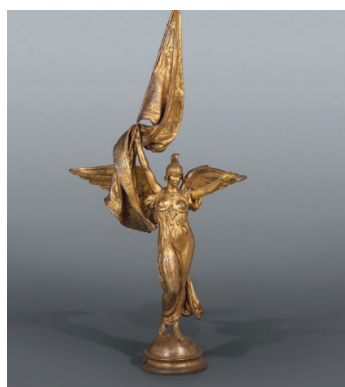
"Victory, First Division Memorial"

Additional information about the exhibition can be found on the American Federation of Arts website: www.amfedarts.org