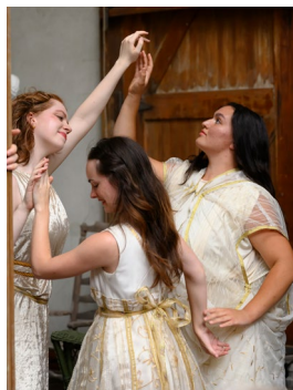
A tableau vivant of the "The Three Graces"