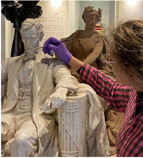
Preparing the 4' Lincoln model to travel