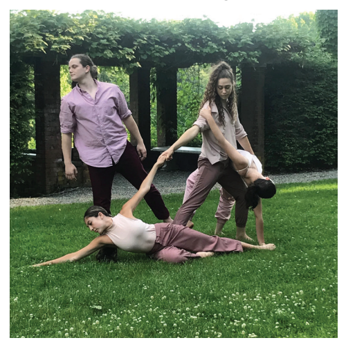
The Young Choreographers Initiative performing in the garden in June 2021

The Young Choreographers Initiative from the Berkshire Pulse Performing Arts Center kicks off our series of outdoor programs on June 30th at 5:00 p.m. Tickets and the full Arts Alive! schedule of readings, dance, and music are at Chesterwood.org/calendar.