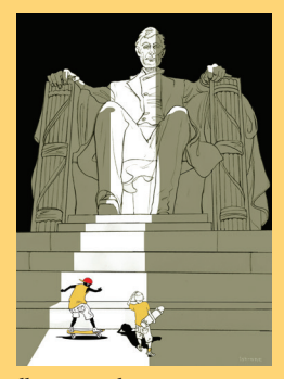
Illustration by Istan Banyai

In case you missed it in person back in 2013, you can find a virtual exhibition of The Timeless Sculpture of Daniel Chester French , a collaboration between Chesterwood and the Concord Museum at www.concordmuseum.org/online-exhibition