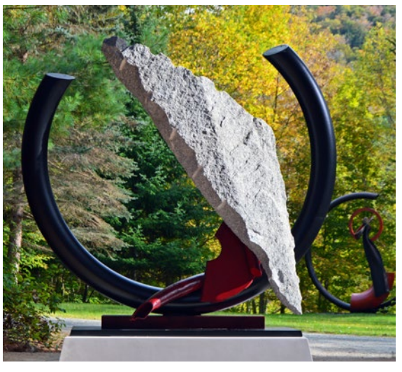
Sisyphean Circle 8-14-17, 2017 Granite/galvanized and powder coated steel 49"h x 53"w x 16"d