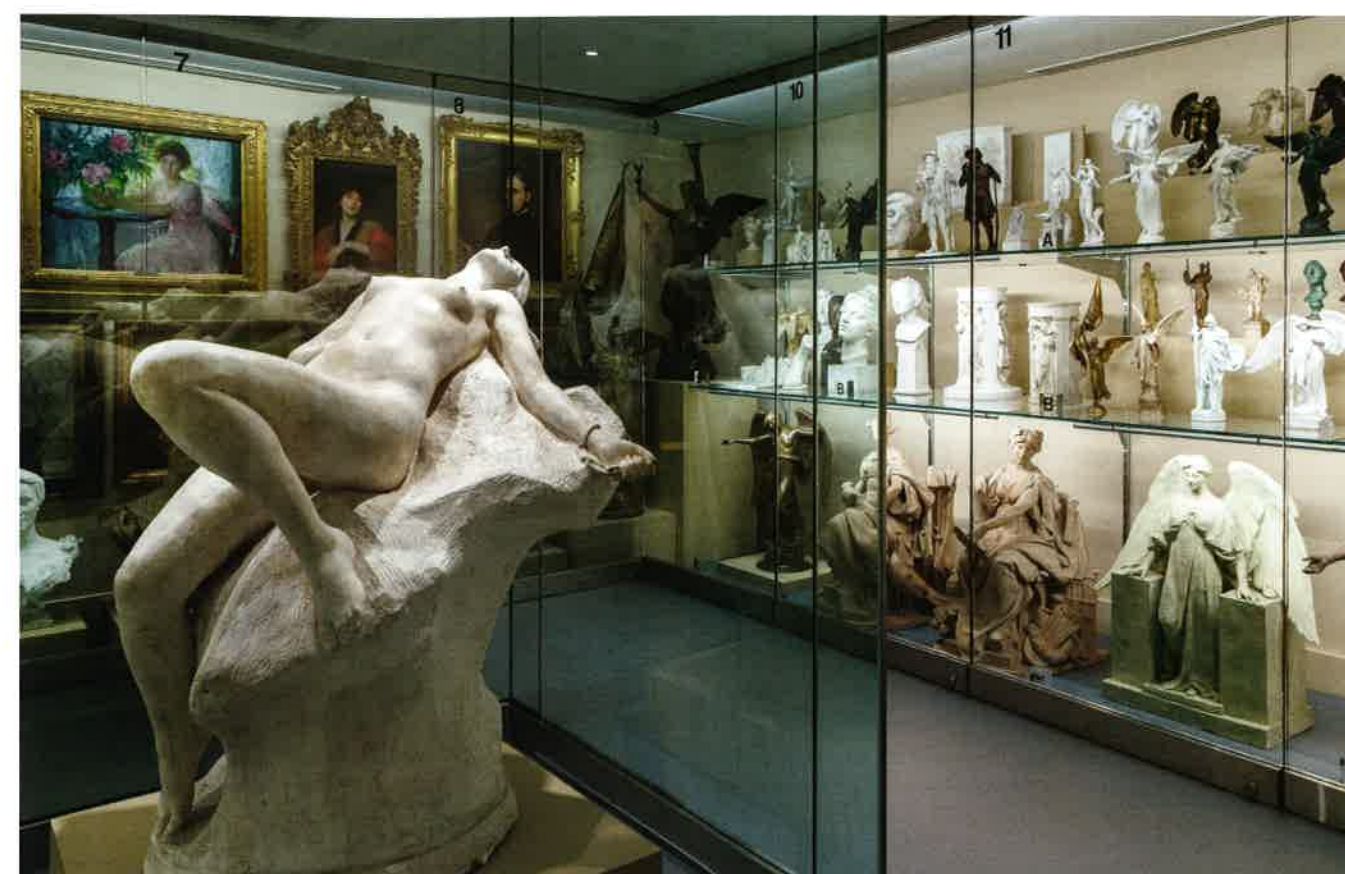
The Daniel Chester French Collections Study Gallery at Chesterwood, Stockbridge, Massachusetts, with French's last work Andromeda occupying the central exhibition case.

The full-size plaster model of French's last work and unknown masterpiece, Andromeda (1929-30) occupies the central exhibition case. While the final marble Andromeda in the Chesterwood studio might be well-known to the frequent visitor to Chesterwood, this cast is closer to the hand of the artist, showing the sculptor's tool marks as he worked the surface of the plaster. In the case at the end of the right/east wall, earlier models for Andromeda illustrate French's progress from his initial