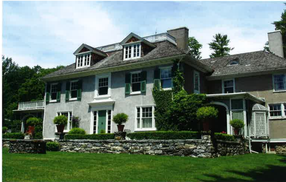
Chesterwood, the former home of Daniel Chester French. Stockbridge, Massachusetts.

(1922, Washington, D.C.). In addition to these distinguished works, during his prolific career French created more than 100 public sculptures located throughout the country and in Paris, France. Many of these works were modeled in his studio at Chesterwood before they were cast in bronze at a foundry or carved into marble by the Piccirilli brothers, Italian artisans who operated a studio in the Bronx, New York. The new biography, Monument Man: The Life and Art of Daniel Chester French by Harold Holzer, reviewed in this issue of Nineteenth Century magazine, includes a detailed geographical listing of the sculptor's public monuments and memorials, published for the first time.