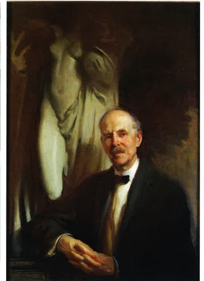
L to R: Daniel Chester French (1850-1931) in his studio at Chesterwood, with a model of Abraham Lincoln for the Lincoln Memorial . John C. Johansen (1876-1964), Daniel Chester French , 1926.